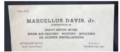
Copy of old letterhead with the former company name.

Work at the time continued to include sheet metal, heating, roofing and flashing, gutters and downspouts, and some industrial work at the Doeskin Paper Mill in Rockland. M. Davis was developing a good reputation