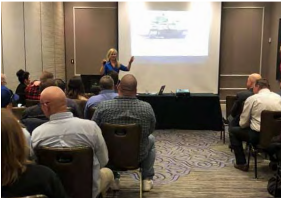
Millennial Translator presenting at the Christiana Hilton