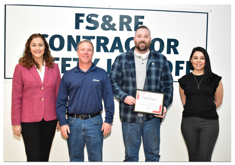
ABC STEP Safety - Diamond Level