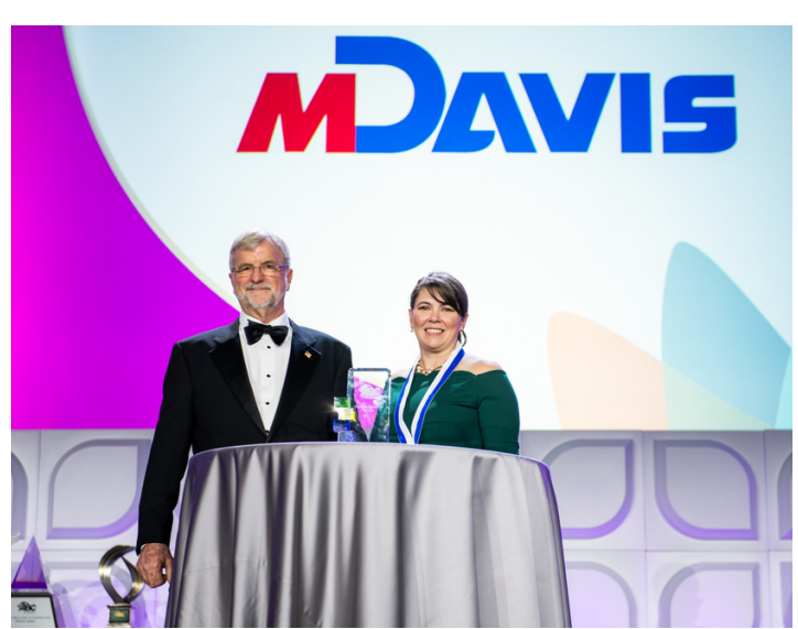
ABC National Diversity 2022