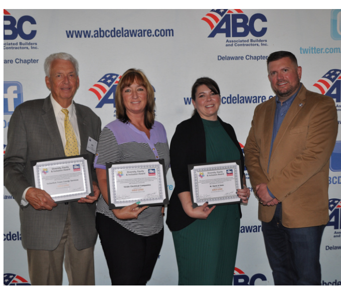
ABC Delaware Diversity 2023